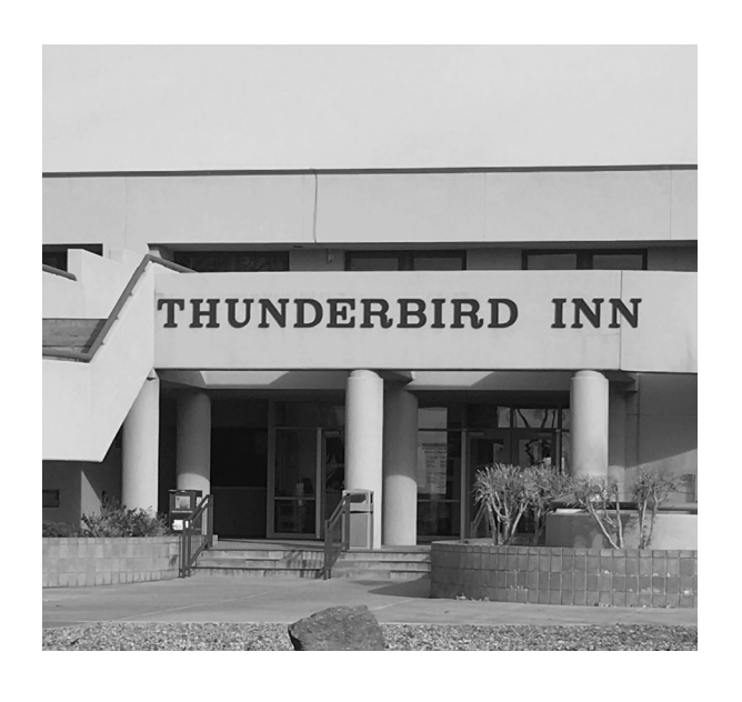
Thunderbird Inn and Dining Facility Kirtland Air Force Base, Albuquerque

A BEP vendor operates the Thunderbird Inn and Dining Facility at Kirtland Air Force Base in Albuquerque. The operator of this facility has distinguished himself in competitions for national and international Air Force dining operations, including winning the "Gold Plate," and also winning the even more prestigious "John L. Hennessy" award.