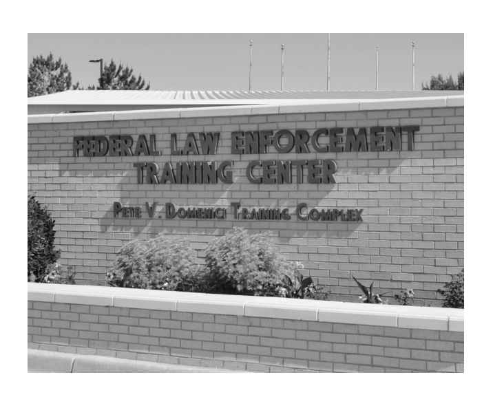
Federal Law Enforcement Training Center Artesia

A BEP vendor also serves the food and dining needs at the Federal Law Enforcement Training Center in Artesia, which is capable of serving meals to 1,000 students. The Federal Law Enforcement Training Center (FLETC) provides training to over 100 different federal law enforcement agencies, as well as local, state, and tribal law enforcement agencies.